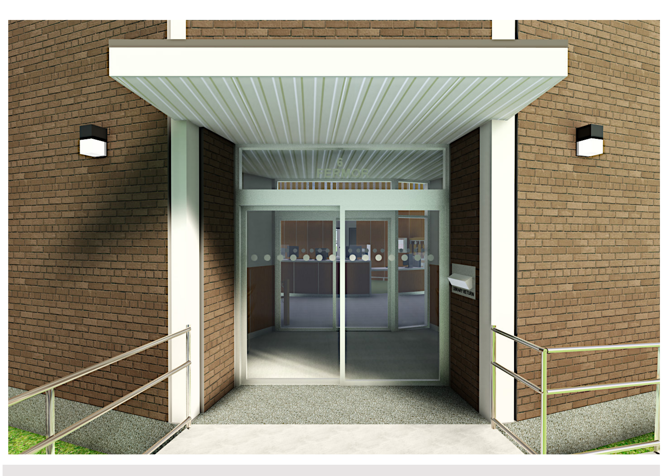
PROPOSED FRONT ENTRANCE & BOOK RETURN