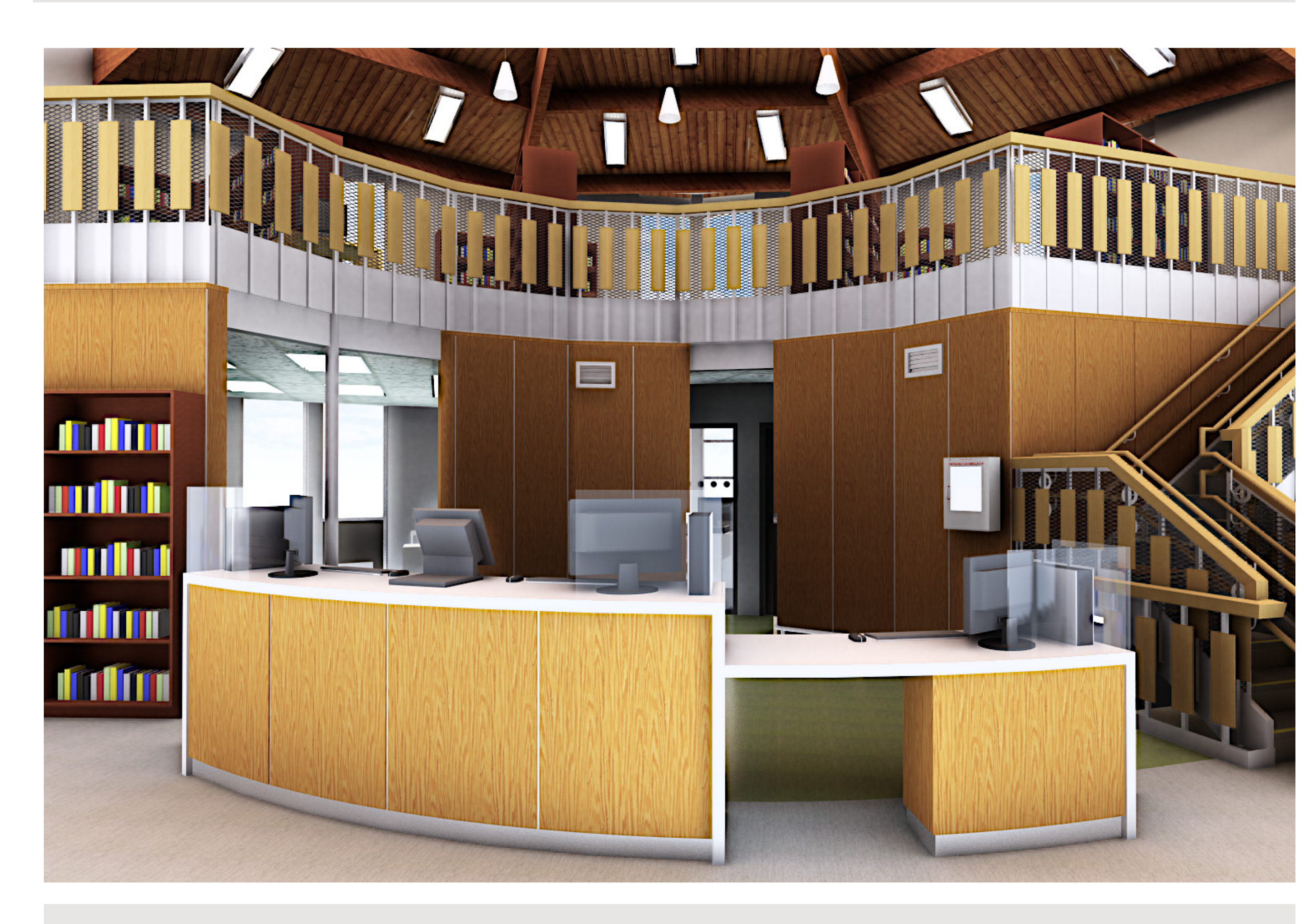
PROPOSED RECEPTION DESK

Increasing accessibility and meeting contemporary library needs are fundamental to the 2016 building renovation. Accessibility improvements include additional accessible parking stalls with access aisle, new sloped walkway into the building and sliding doors at the Fermor entry. The entry will also have a refreshed vestibule and a new book return.