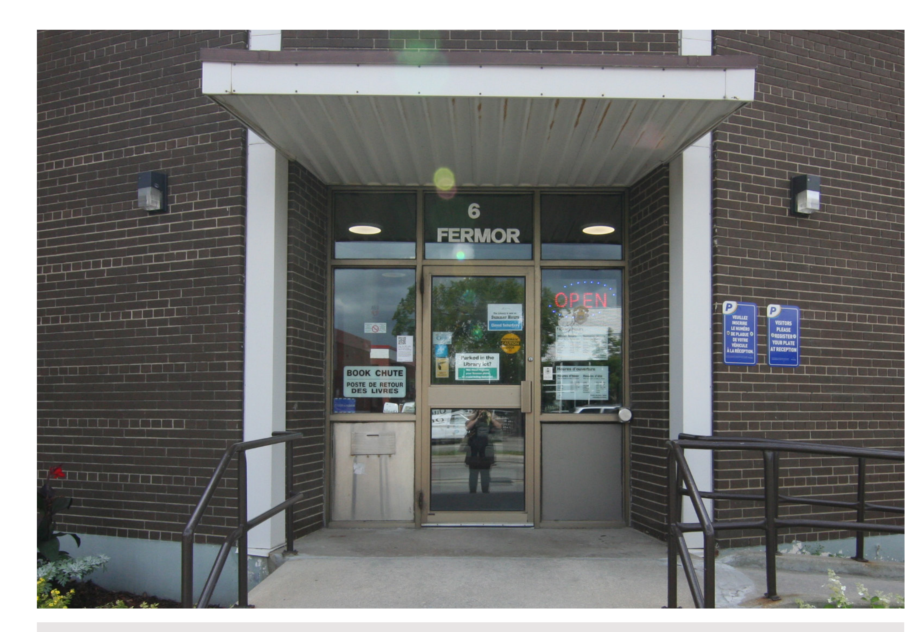
EXISTING FRONT ENTRANCE & BOOK RETURN